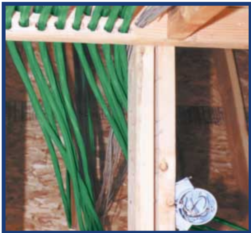
To ensure that the rigors of installation do not damage the cable's integrity, Tri-Net tests and verifies the cable performance both in the lab and on-site when the installation is complete.

Each main room in the house has a 4-port multimedia outlet consisting of two coaxial cables for television transmission (antenna, CATV and satellite-based) and cable-based Internet hook-ups; two Cat 5e cables for phone