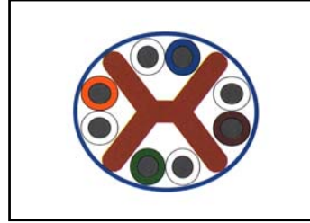
Cross section of DataTwist 600e